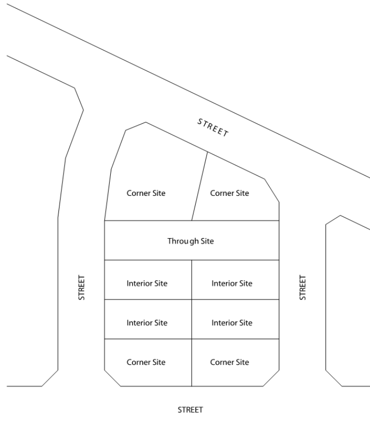
Figure 2-2: Illustration of Site Definition

Site Coverage: that portion of the site that is covered by principal and accessory buildings.